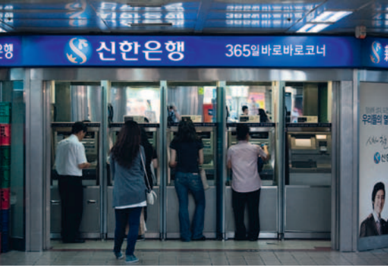
An ATM or a cash machine

'We pay off what we owe - need to pay back - every month. We don't want to get into debt /det/ with the credit card company. We don't want to have to pay interest.'