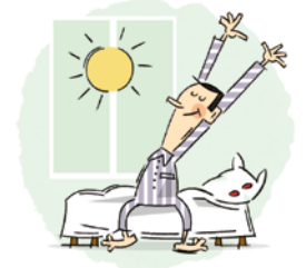
get out of bed