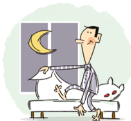
go to bed