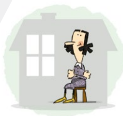
stay at home