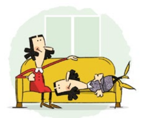
sit/lie on the sofa