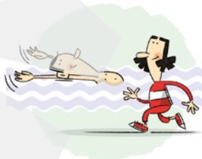
go for a run/swim