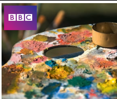
THE BLIND PAINTER p16

SPEAKING 1.1 Talk about important dates in your life 1.2 Talk about the differences