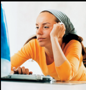
▶ Stuck in a rut p68