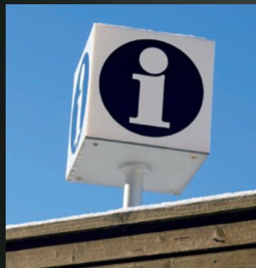
▶ Can you tell me ...? p72