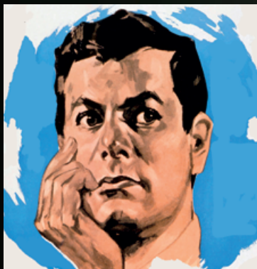
▶ The great impostor p70