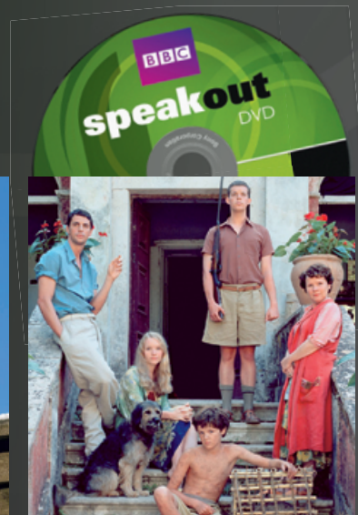
▶ My Family & Other Animals p74